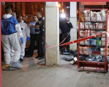
Site of Attack